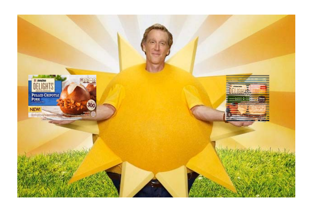
Go Meat & More!