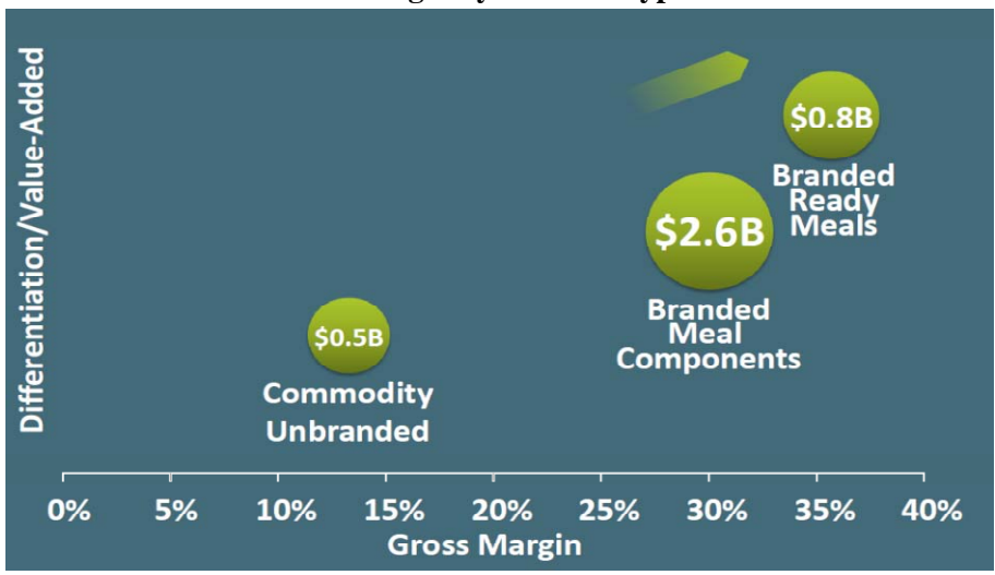
Gross Margin by Product Type